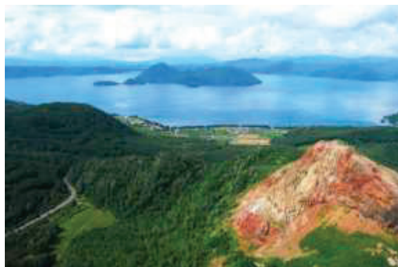
SDGs Goals Number

Toyako Usu mountain Geopark with unique topography in the world. Learning in fieldwork is its charming point. Volcanic-centered activities as like disaster prevention, disaster reduction and the ecosystem. Those activities are good start for people learning SDGs.