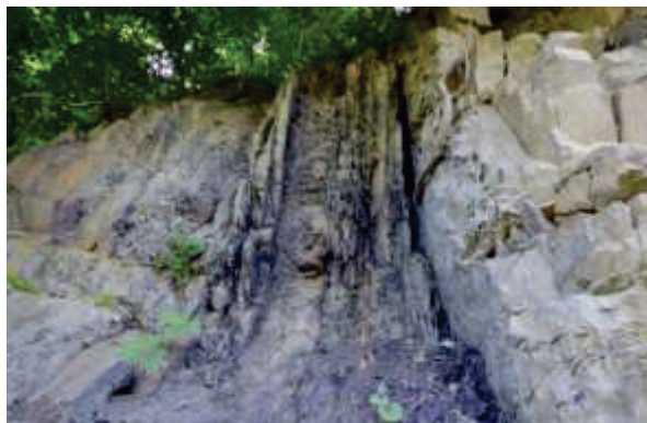
SDGs Goals Number

The developing of Mikasa city is taking the opportunity of coal which is the blessing of earth. The whole of Mikasa city is assgained as Mikasa Geopark becasue of that. The city is Geopark in Hokkaido and positively running for SDGs'. Mikasa is the first spot which was assigned for "regional ESD activity promotion base"