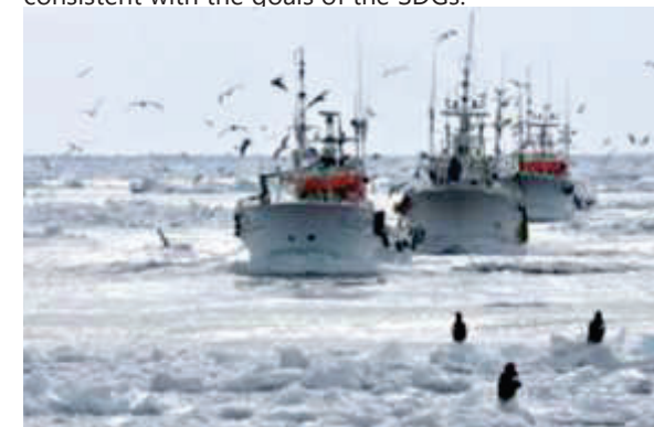
SDGs Goals Number

People's efforts to sustain local nature and fisheries are also consistent with the goals of the SDGs.